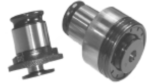
Positive Drive Torque Controlled