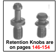
Retention Knobs are on pages 146-154